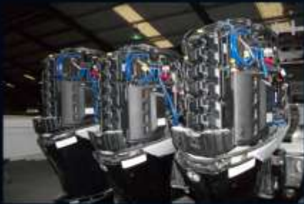
SHOWN INSTALLED ON TRIPLE 350 VERADOS.

"I use SuperFlushes on every boat I own. All 19 of them. For a good reason: This system works."